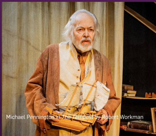
Michael Pennington in The Tempest